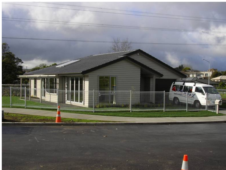
Figure 1 The Waitakere NOW Home®

The Waitakere NOW Home® (shown in Figure 1) was developed by Beacon Pathway ( www.beaconpathway.co.nz ) as a research project designed to examine practical methods of improving the sustainability of an 'average' new home using affordable technologies that are readily available now. It is neither a social housing project nor simply a collection of expensive technologies. A second new NOW Home® has been constructed in Rotorua in 2006 by Housing New Zealand following a similar philosophy.