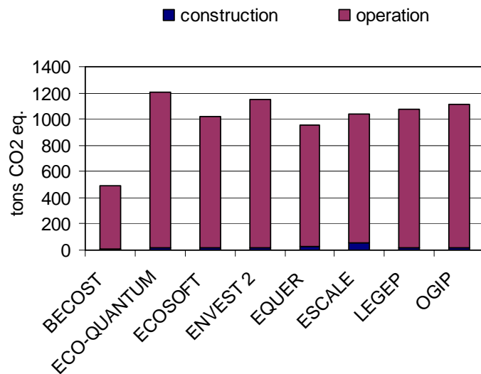
Fig. 2 Predicted Greenhouse gas emissions over 50 years from a simple cube structure composed of reinforced concrete.

For 1 kg of concrete (Fig. 1) variation of +/- 20% around the mean emission value for all tools was related to the type of concrete, amount and type of cement, different production processes and the nature of energy production and allocation process.