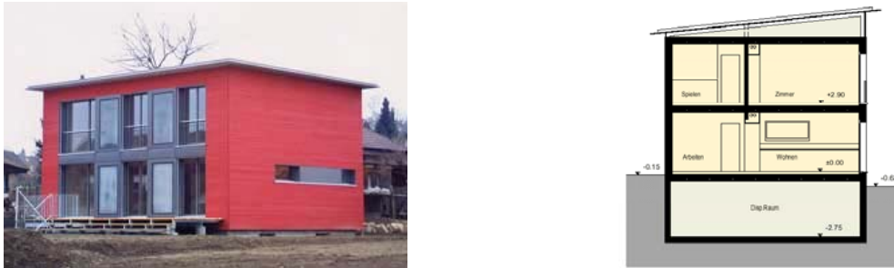
Fig. 3: The Swiss “FUTURA” house considered in the study

The second case was based on a low energy building, prefabricated in Switzerland and known as FUTURA (Fig. 3). It is a single-family house with two levels (210 m 2 heated area), well insulated, with a high solar aperture. Gas is used for space heating and domestic hot water, demand being related to the Swiss climate. A European electricity mix is used. A detailed description of the building was provided to all tool developers, who performed a life cycle assessment based on 80 year operation period. Three different construction materials (wood, brick, concrete) were considered separately.